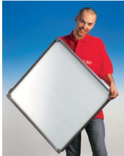
Type CLA composite light The super-lightweight cover

Producer: HAGO 4600 Wels, Austria. www.hago.at